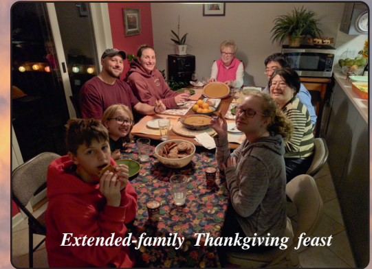
Extended-family Thanksgiving feast