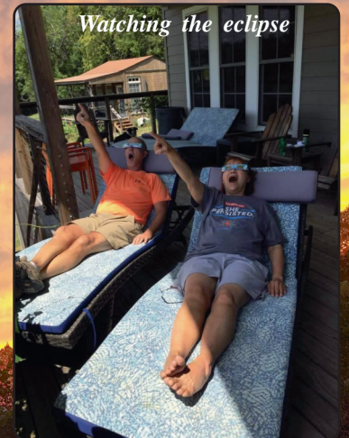
Watching the eclipse