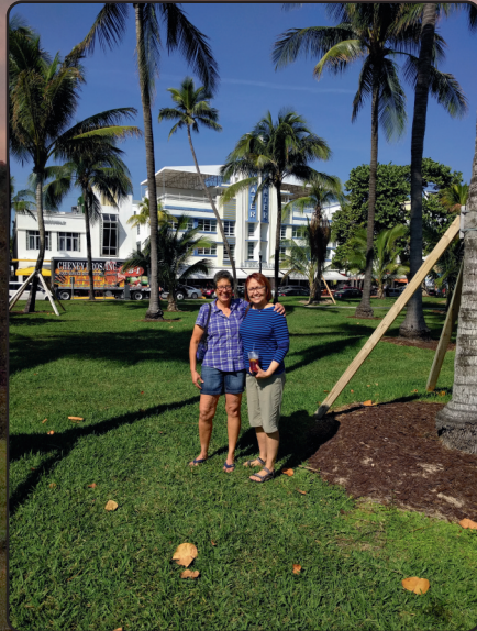
Miami in February